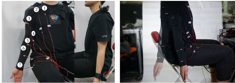
Figure 1: Left: positions of vibrators and trackers. Right: an image of the induced kinesthetic illusion.

Hiroyuki Kajimoto The University of Electro-Communications Tokyo, Japan kajimoto@kaji-lab.jp