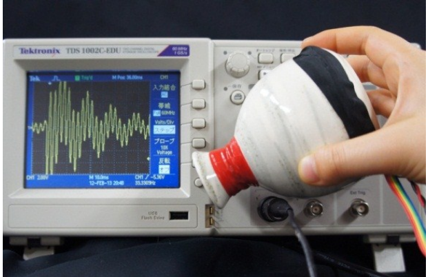
Fig. 3. Sake-bottle-shaped device with a vibro-tactile actuator

To verify the appropriateness of the created model, we manufactured a Sake bottle shaped device with a vibro-tactile actuator (Haptuator Mark II, Tactile Labs Inc.) and present the modeled vibration in Fig. 3. We demonstrated our device at some domestic conferences and obtained quite positive reactions.