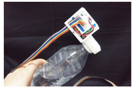
Fig. 4. The device attached to a plastic bottle