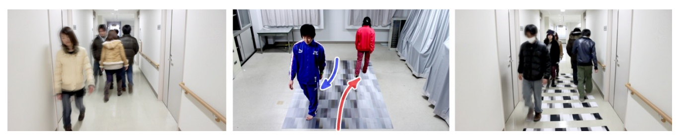
Figure 1 ( a ) Congestions and collisions occur in a public pathway, (b ) Proposed method: visual cues produced, (c ) Proposed method keeps the pedestrians on the right of the pathway and prevents congestions and collisions.

Masahiro Furukawa<sup>*</sup> Hiroyuki Kajimoto<sup>*</sup>