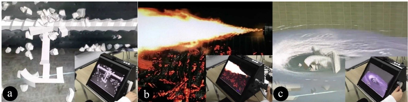
Figure 1: StressMincer (a: Shredding, b: Burning by flamethrower, c: Flushing with toilet water)

Hiroyuki Kajimoto The University of Electro-Communications Chofu, Tokyo, Japan kajimoto@kaji-lab.jp