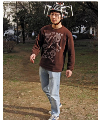
Figure 3. Scene of experience